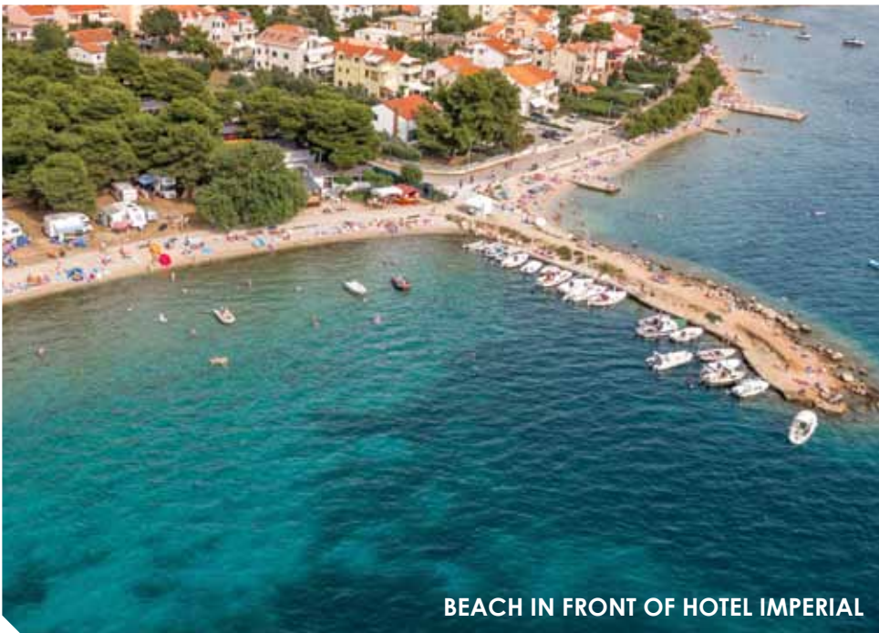
BEACH IN FRONT OF HOTEL IMPERIAL