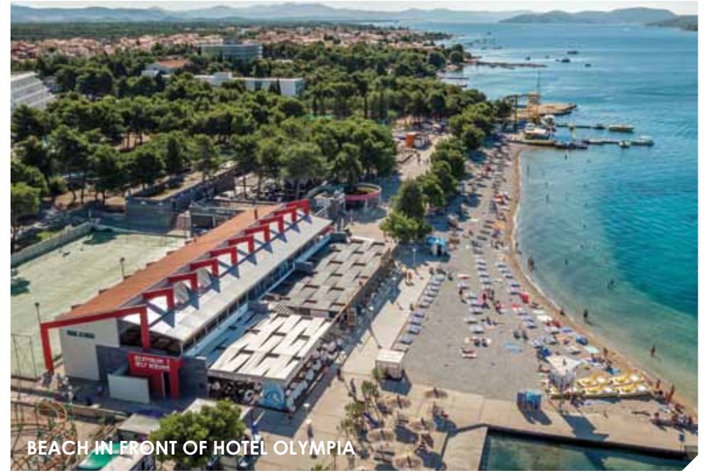
BEACH IN FRONT OF HOTEL OLYMPIA